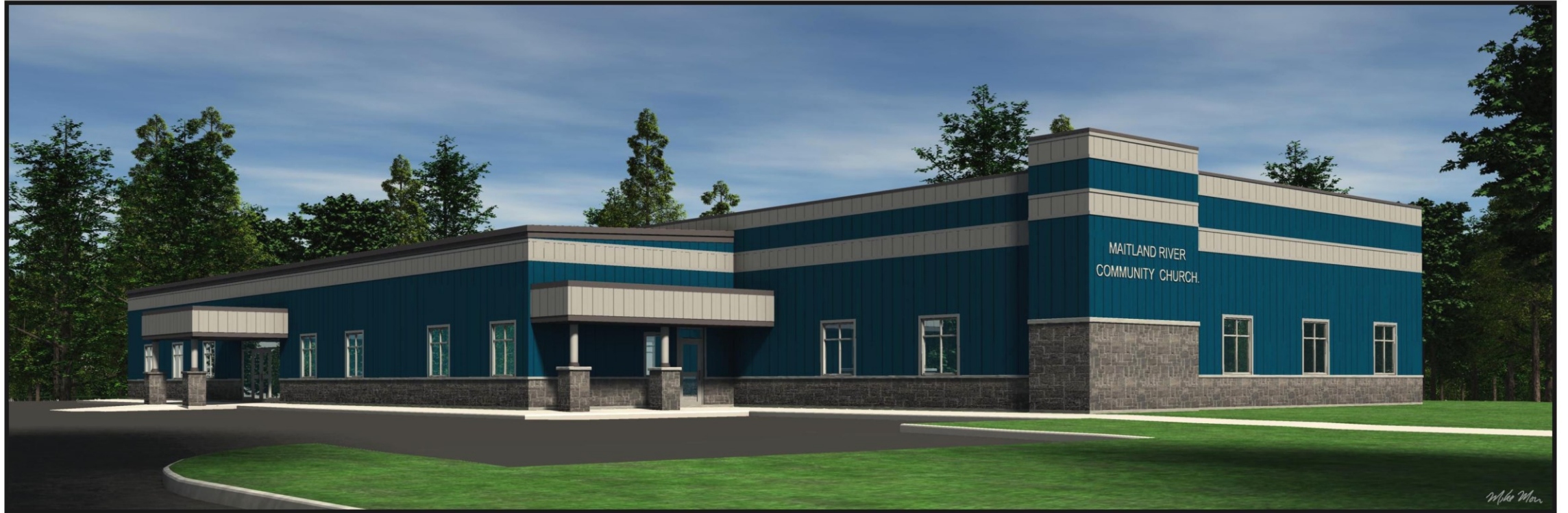
Proposed Exterior Elevation Concept for Maitland River Community Church