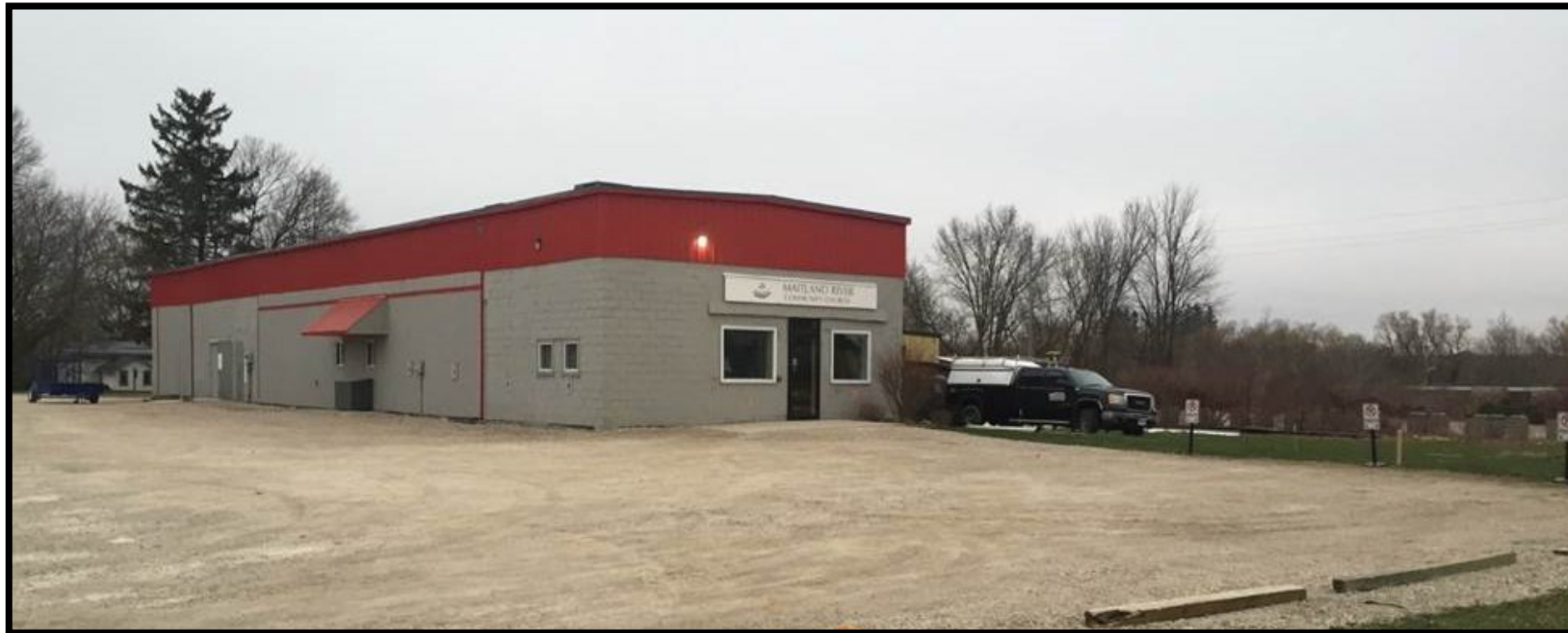
Existing Exterior for Maitland River Community Church