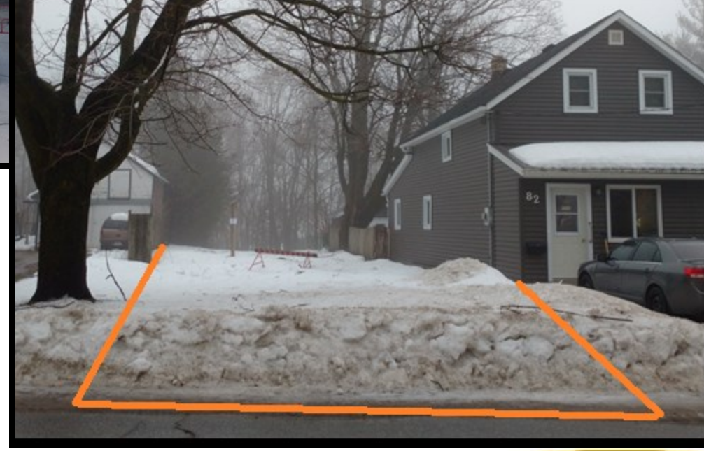
Site Visit in 2017