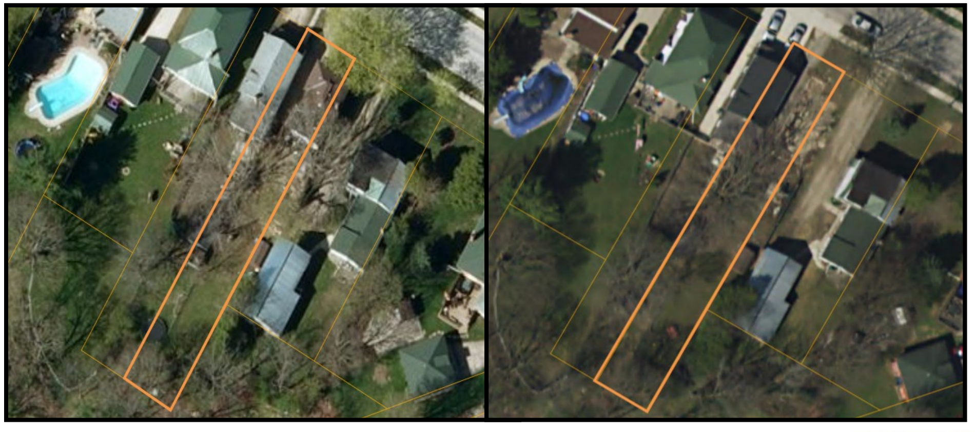
2010 Aerial Photo