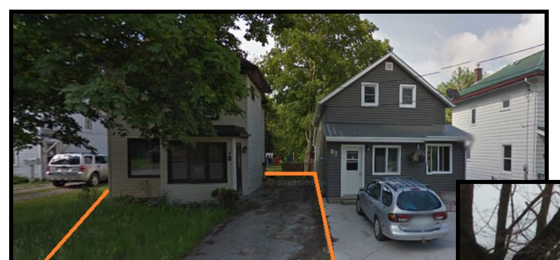
Google Streetview in 2013