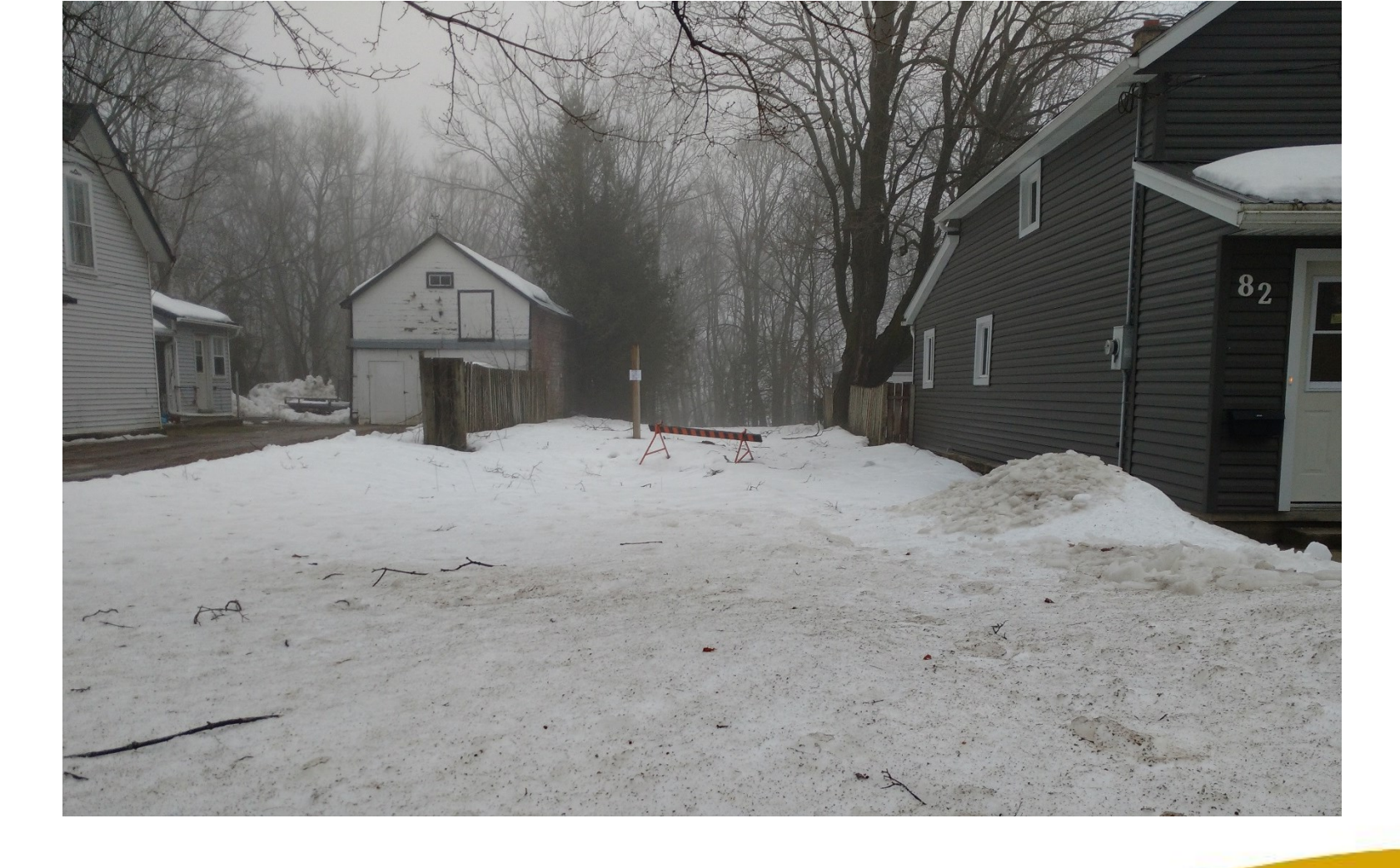
Subject Property Currently