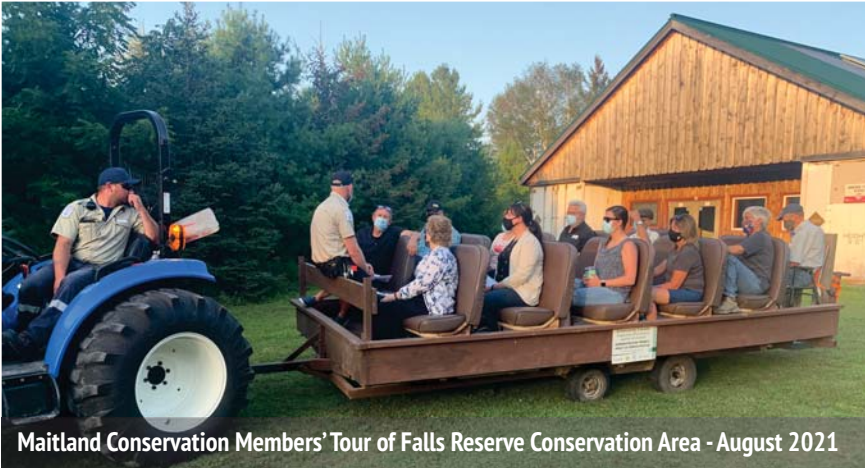
Maitland Conservation Members' Tour of Falls Reserve Conservation Area - August 2021

A five-year infrastructure and equipment strategy was developed for the organization.