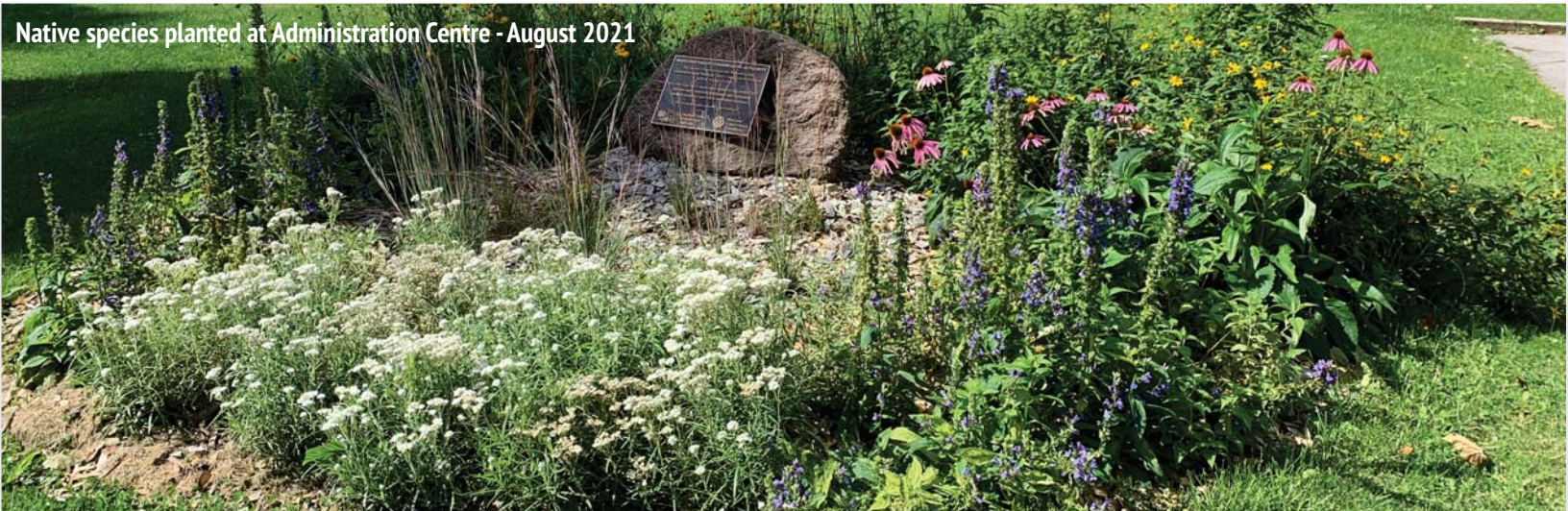
Native species planted at Administration Centre - August 2021