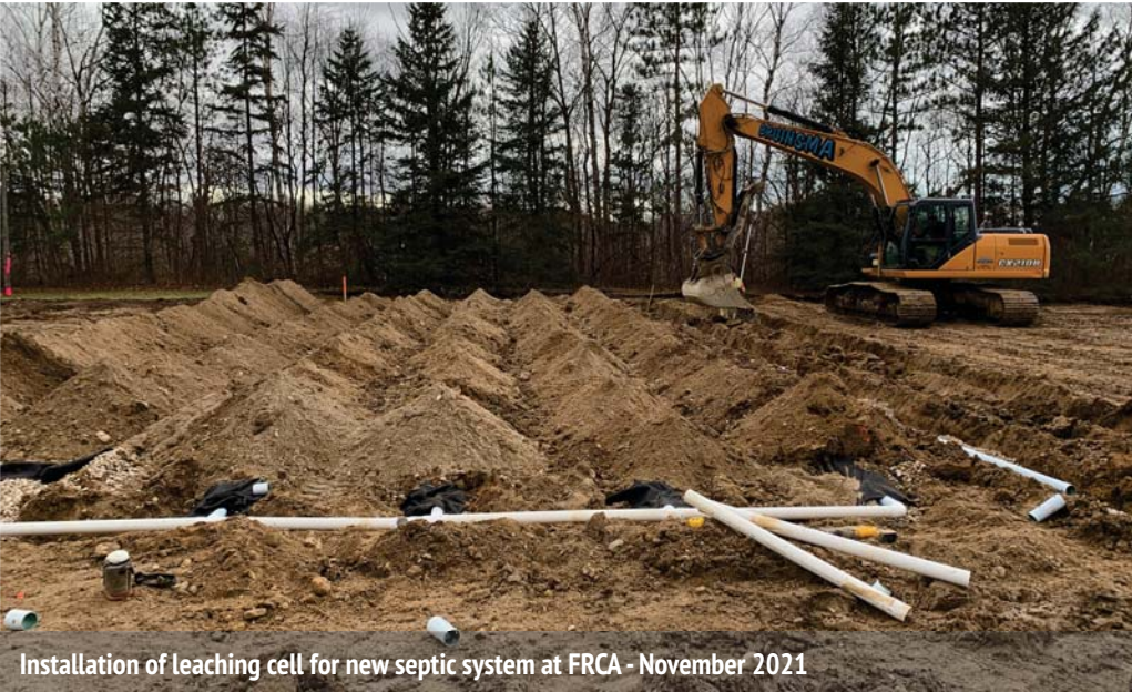
Installation of leaching cell for new septic system at FRCA - November 2021