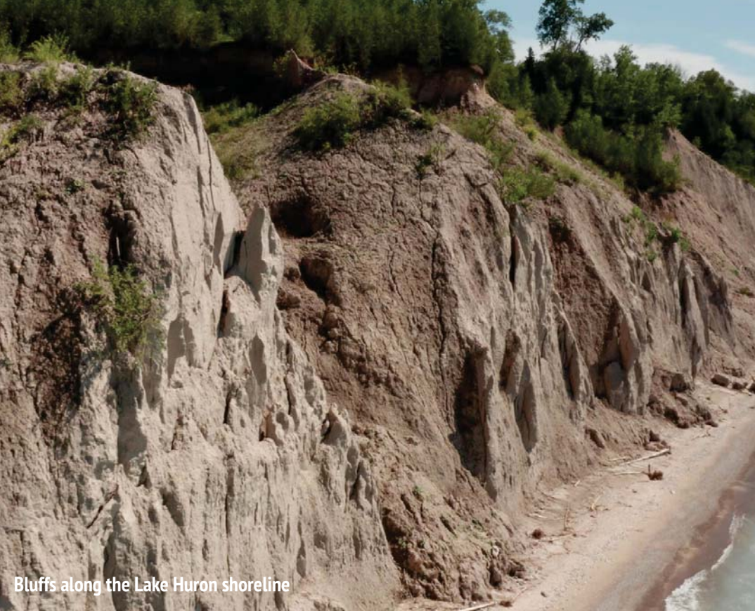
Bluffs along the Lake Huron shoreline