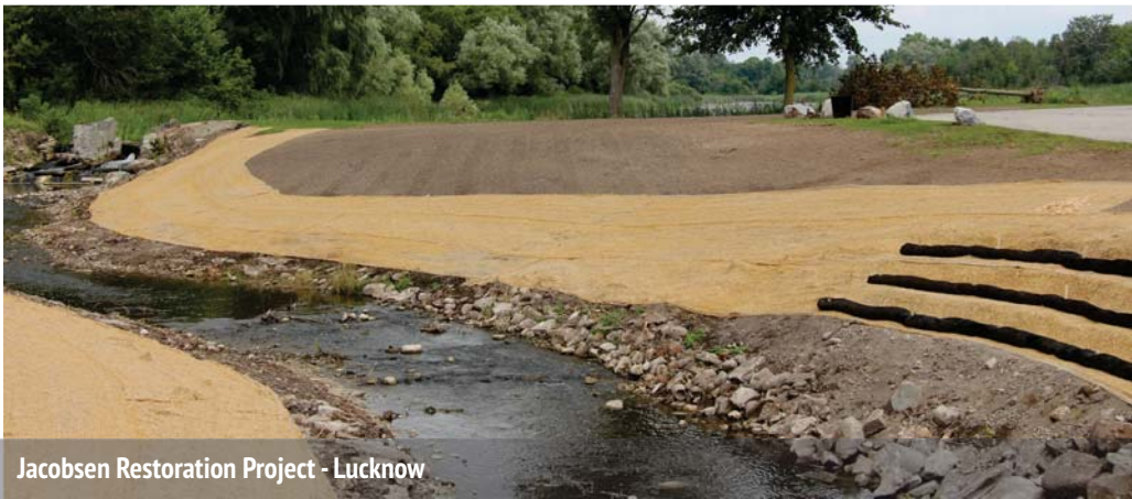
Jacobsen Restoration Project - Lucknow