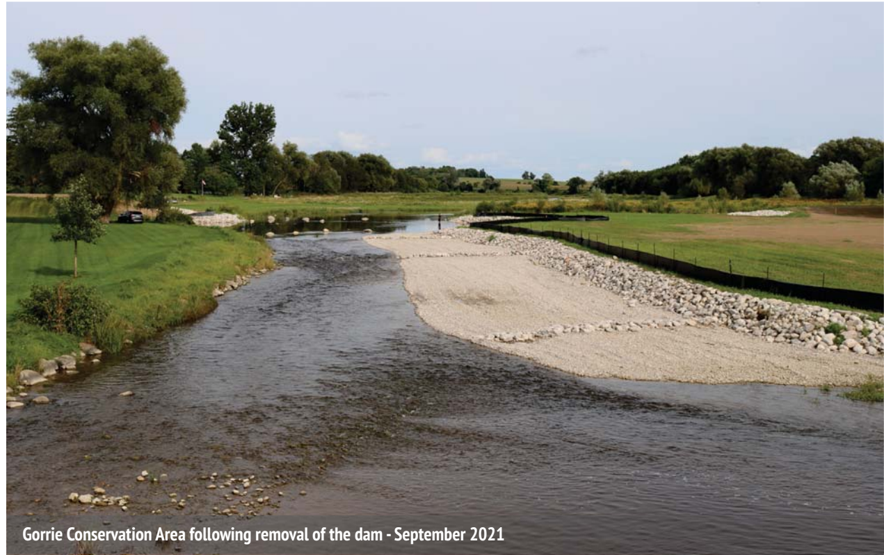
Gorrie Conservation Area following removal of the dam - September 2021