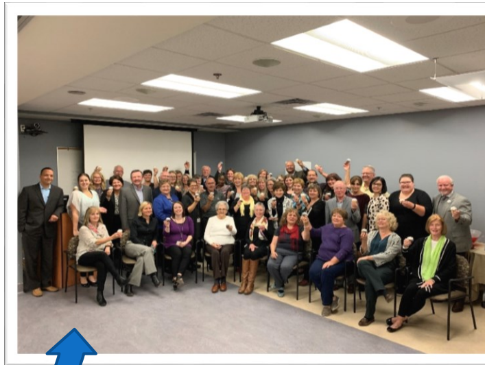
Submission of Full OHT Application October 2019