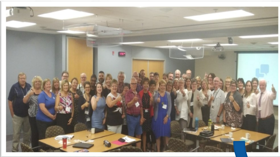
Start of Full OHT Application July 2019