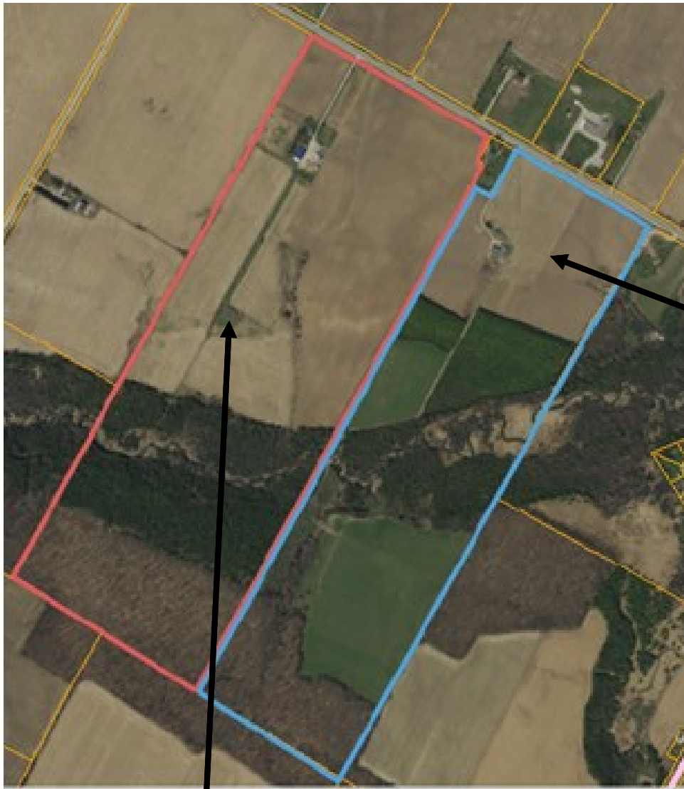
C38-18, 39705 Belgrave Road