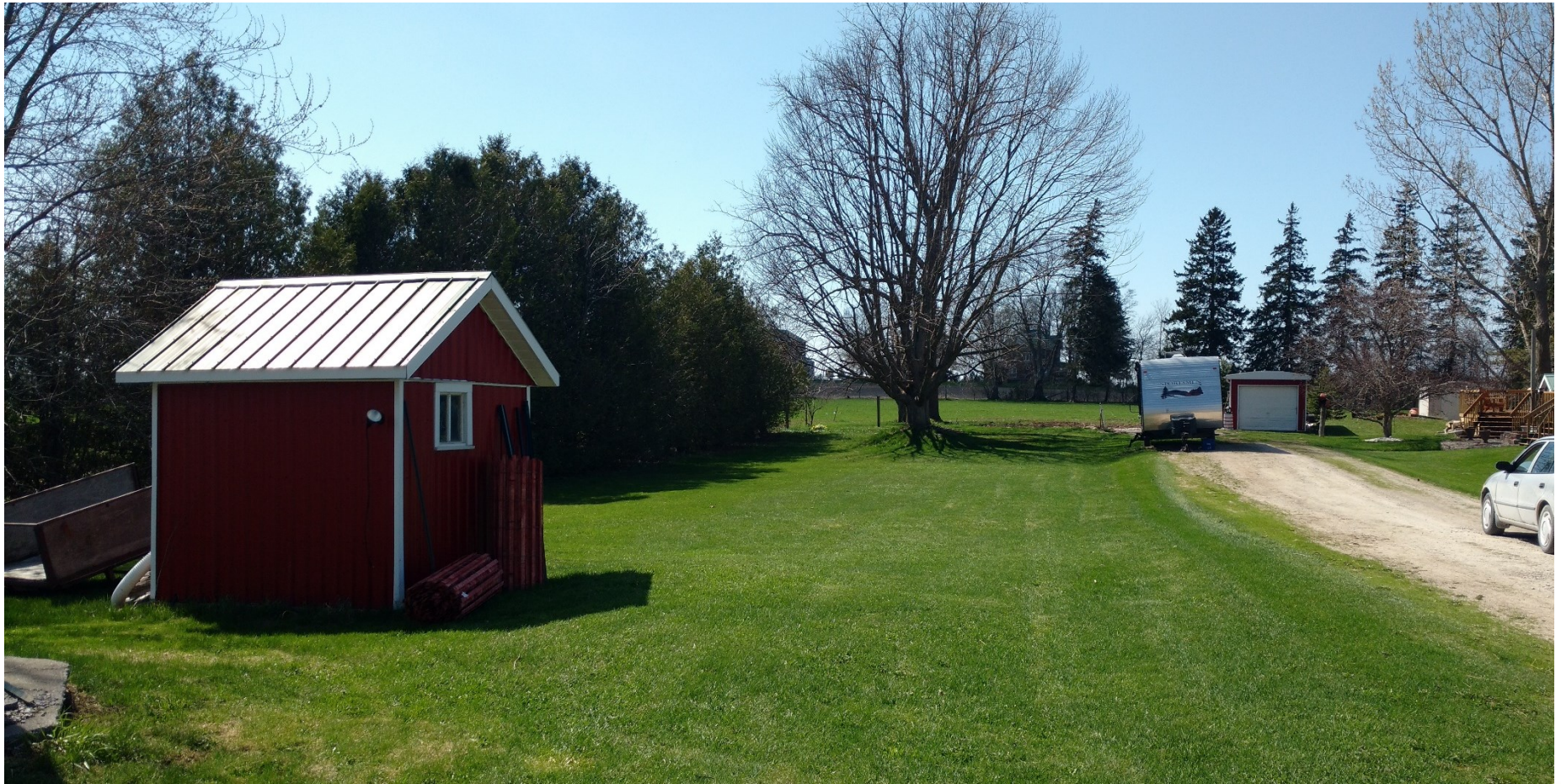
Photo of the proposed severed parcel