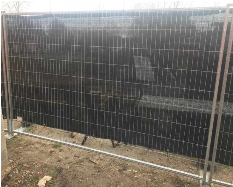
Image: Fence type to be used to protect public from access to construction area.