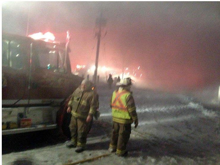
FDNH firefighters working on large Barn fire.

*The FDNH does not perform this service for the Municipalities of Central Huron and Morris-Turnberry.