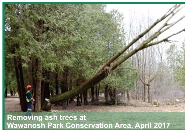
Removing ash trees at Wawanosh Park Conservation Area, April 2017