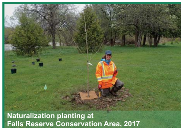
Naturalization planting at Falls Reserve Conservation Area, 2017