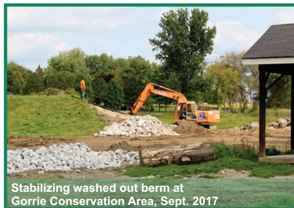
Stabilizing washed out berm at Gorrie Conservation Area, Sept. 2017