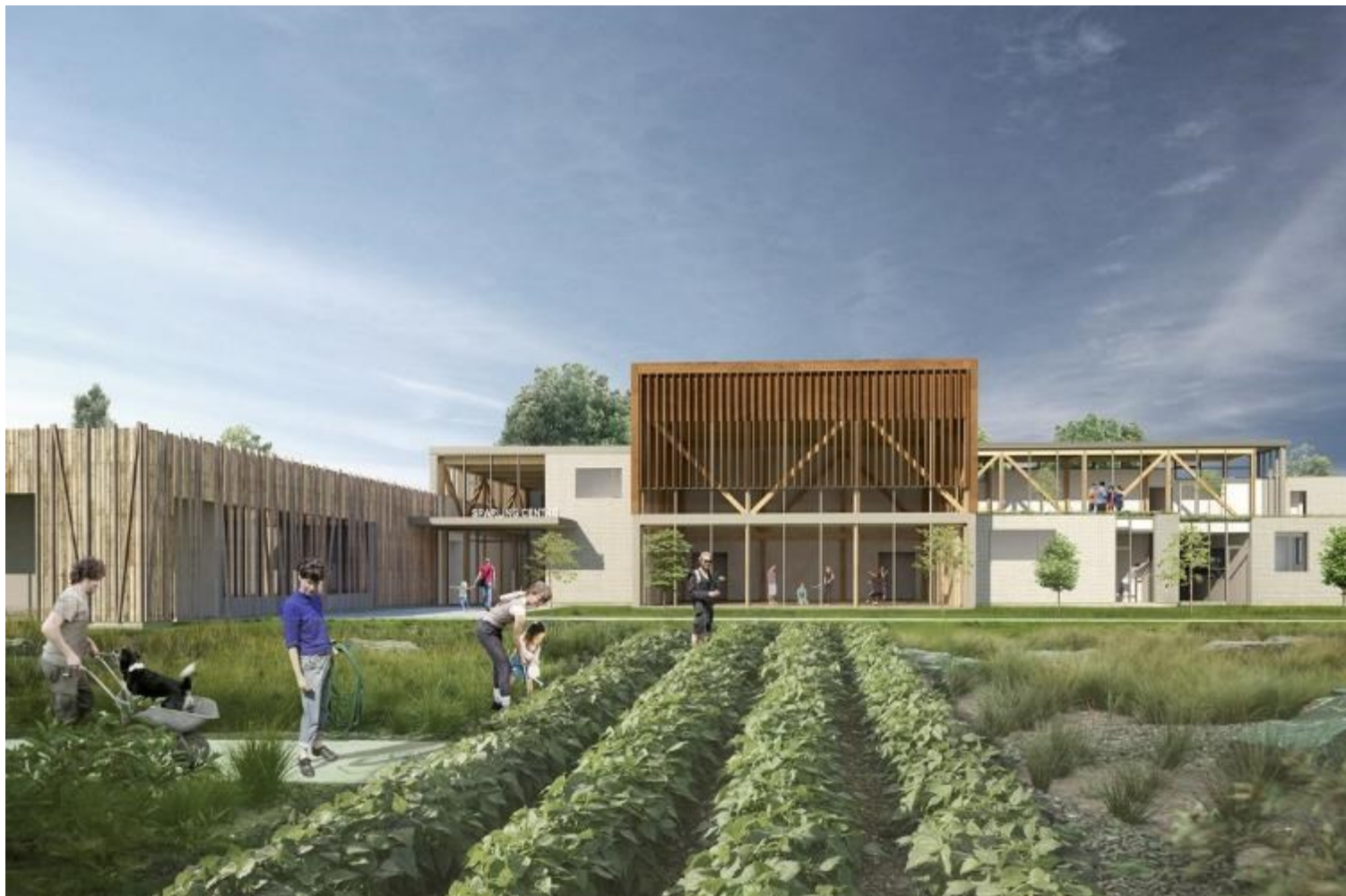
Rendered rear of proposed building