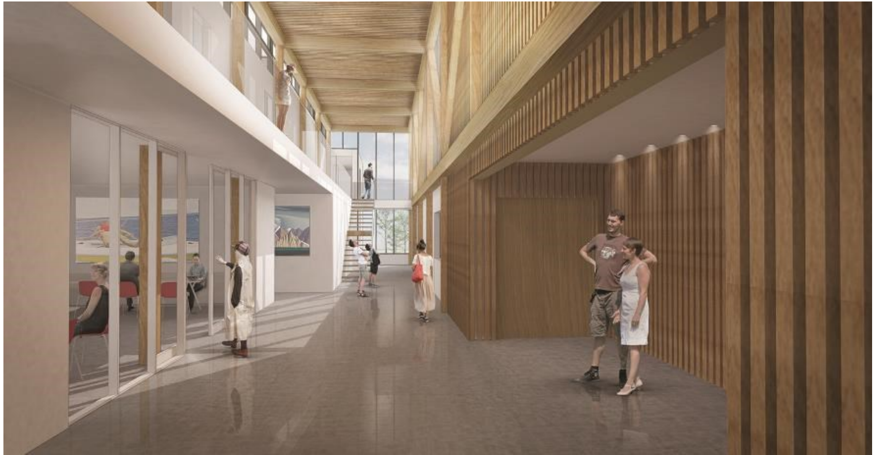
Rendered interior of proposed building