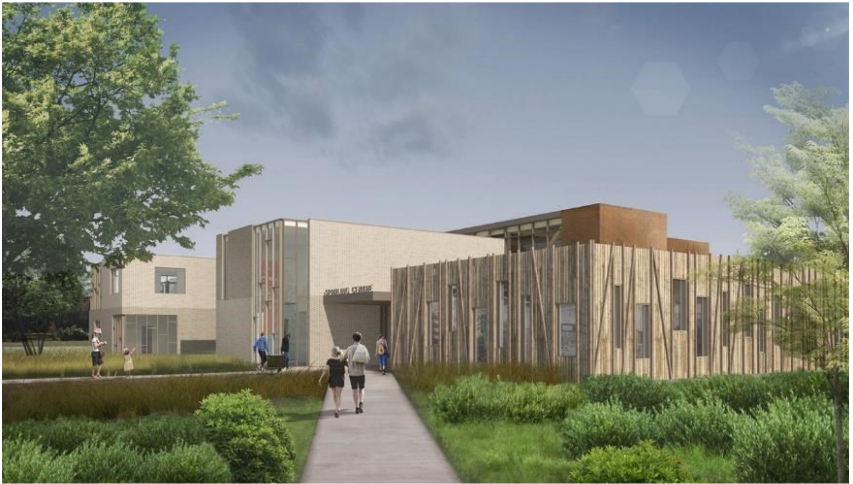
Rendered front of proposed building