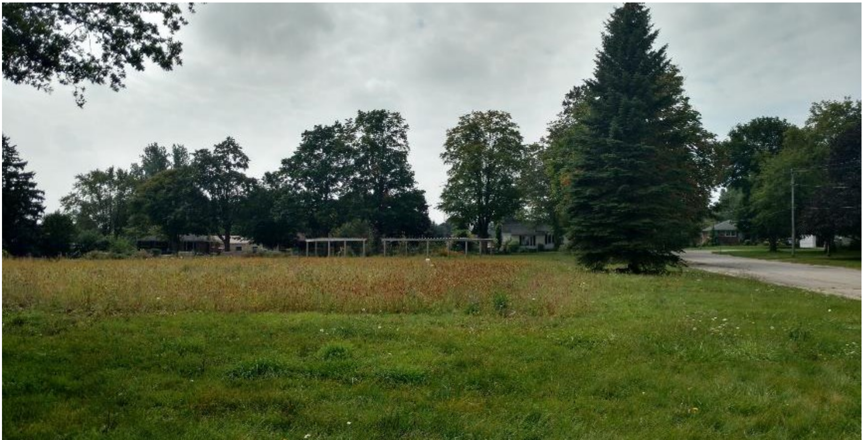
Existing front of subject property