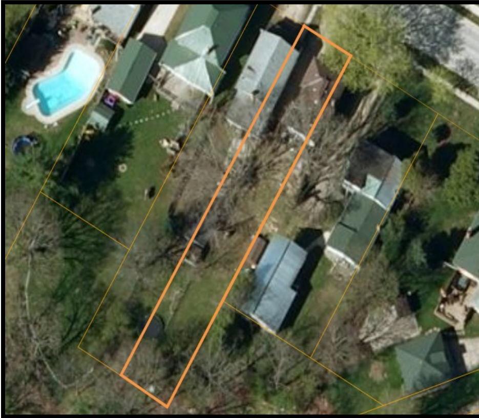
2010 Aerial Photo