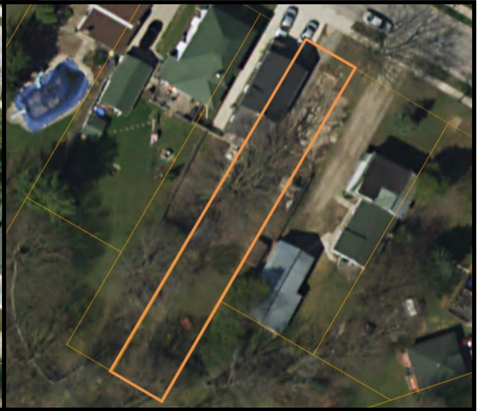
2015 Aerial Photo