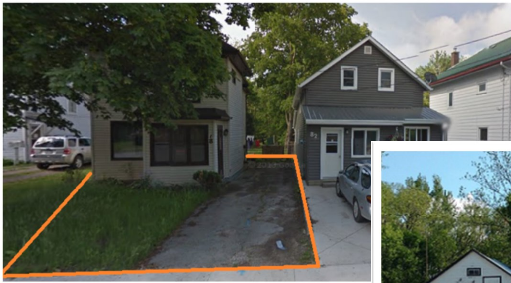
Google Streetview in 2013