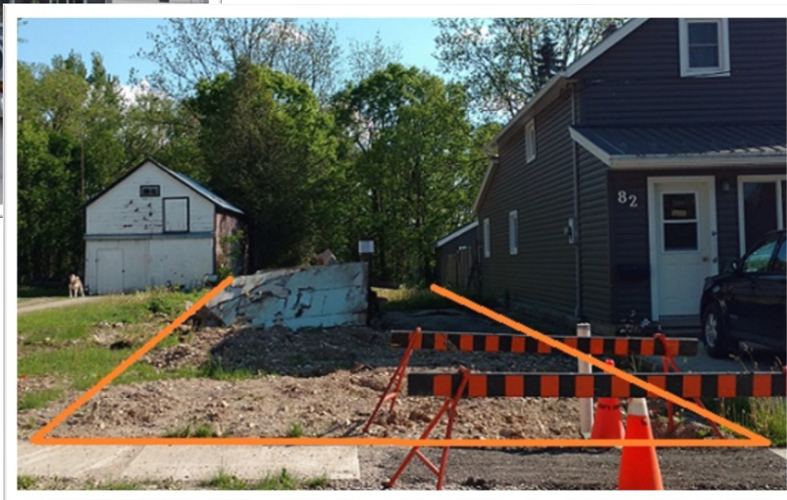
Site Visit in 2017