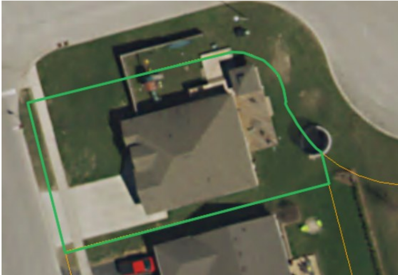
2015 Aerial Photo